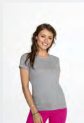
IMPERIAL WOMEN 11502