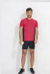
SYDNEY MEN 01414